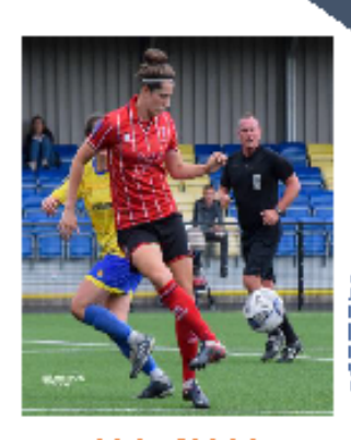
2021/2022 Top Goal Scored!